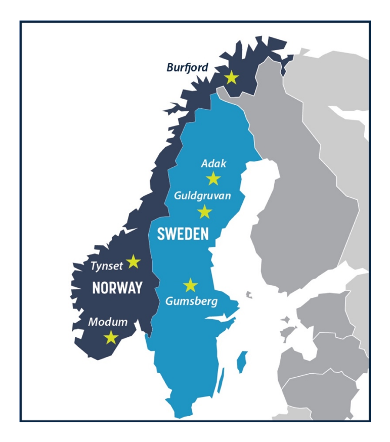
Figure 1. Location of Boreal's Key Projects